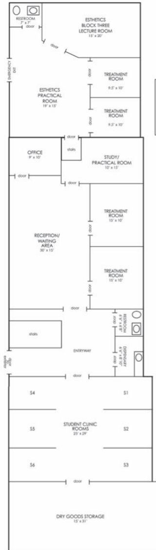
ANN WEBB SKIN INSTITUTE FLOORPLAN ----- FIRST FLOOR